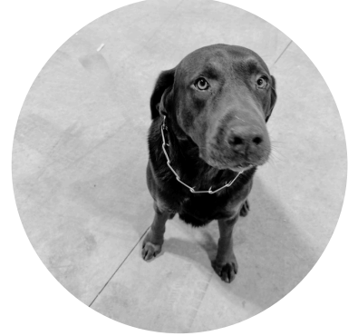
Riggins Shop Dog